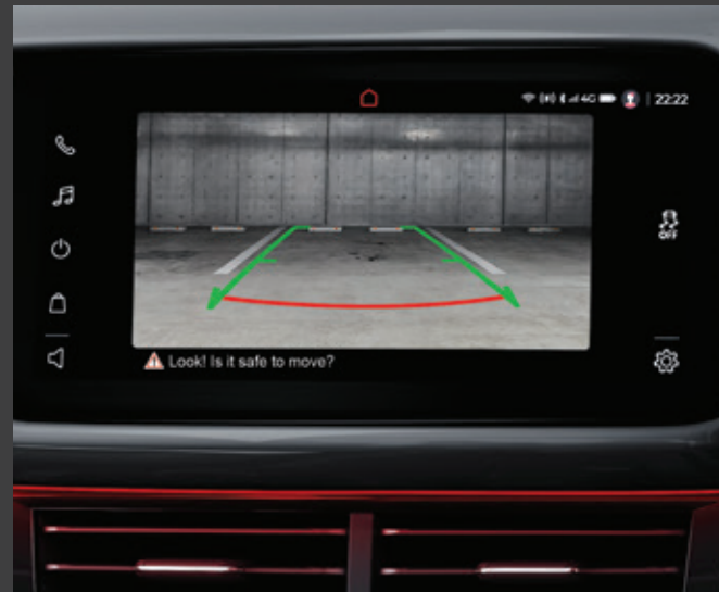
▲ Park Distance Control and Rear-view Camera