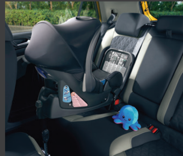
▲ ISOFIX Child Seat Mount