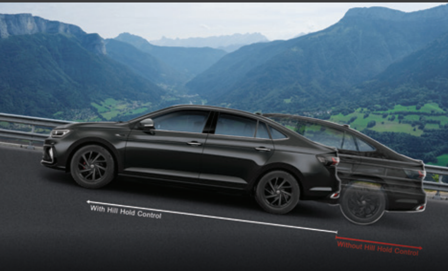
▲ Hill Hold Control

As part of Volkswagen's long-standing commitment to safety, Virtus has been awarded the prestigious 5-star Global NCAP safety rating. Packed with 40+ safety features, the sedan is a reflection of the uncompromising standards that make the Virtus GT Edge Limited collection, #SafeLikeAVolkswagen. With trustworthy and reliable German-engineering at its heart, the strong body shell keeps you secure. Along with up to 6 airbags which ensure safety in the event of a critical crash and ESC (Electronic Stability Control), which detects critical situations and prevents skidding to bring the car safely under your control. While, tire pressure deflation warning, 3-head rests at the Rear, ISOFIX child seat anchorage and brake disc wiping make the Virtus GT Edge Limited Collection a safe choice.