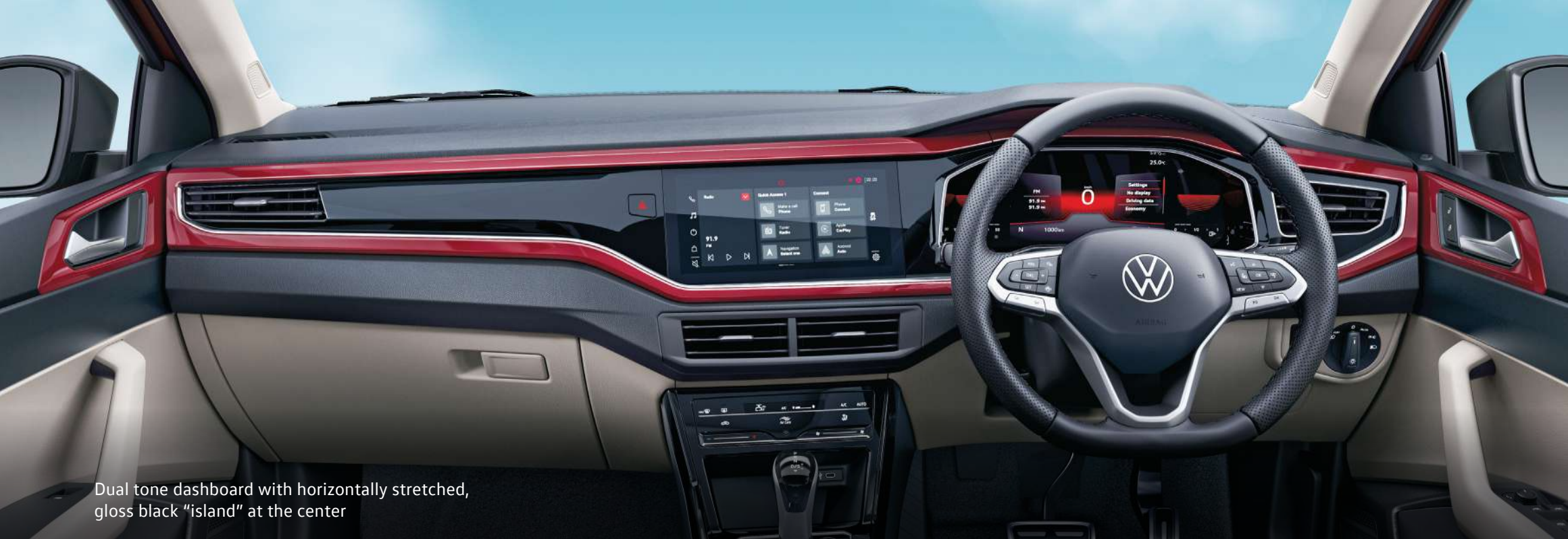
Dual tone dashboard with horizontally stretched, gloss black "island" at the center

Find unmatched comfort and understated elegance, when you're in a Virtus. With a best-in-segment wheelbase* (2651 mm), the Virtus has room for everything you love. The digital cockpit and infotainment system placed in a high-gloss black 'island' at the centre exudes a touch of class. Its plush leatherette seats turn any long drive in a Virtus into a comfortable fun drive.