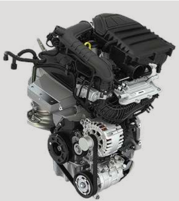
1.0L TSI engine