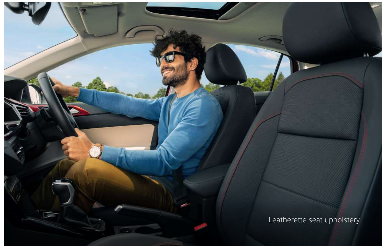
Leatherette seat upholstery

Find unmatched comfort and understated elegance, when you're in a Virtus. With a best-in-segment wheelbase* (2651 mm), the Virtus has room for everything you love. The digital cockpit and infotainment system placed in a high-gloss black 'island' at the centre exudes a touch of class. Its plush leatherette seats turn any long drive in a Virtus into a comfortable fun drive.