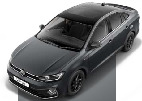
Carbon Steel Grey Matte