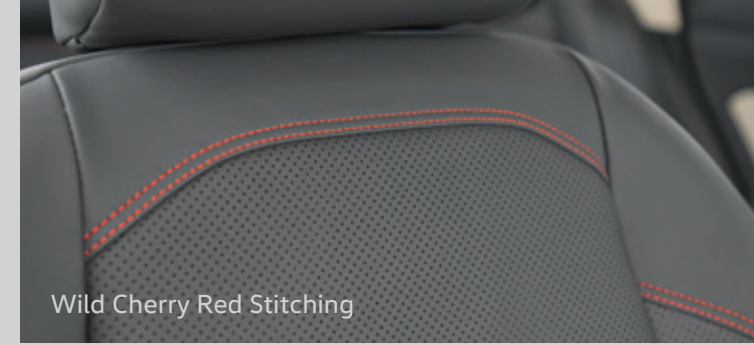
Wild Cherry Red Stitching

The Virtus GT Edge collection extends its performance credentials to the interior as well. The leather and leatherette combination seat upholstery with Wild Cherry Red stitching gives the interior a premium and performance-oriented look. Alu pedals and Laser Red Ambient Lighting further accentuate the sporty interior theme of the Volkswagen Virtus GT Edge Limited Collection.