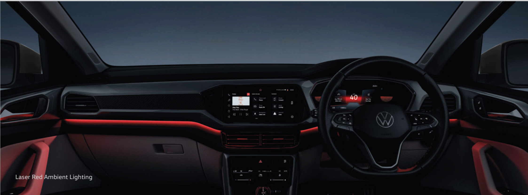
Laser Red Ambient Lighting