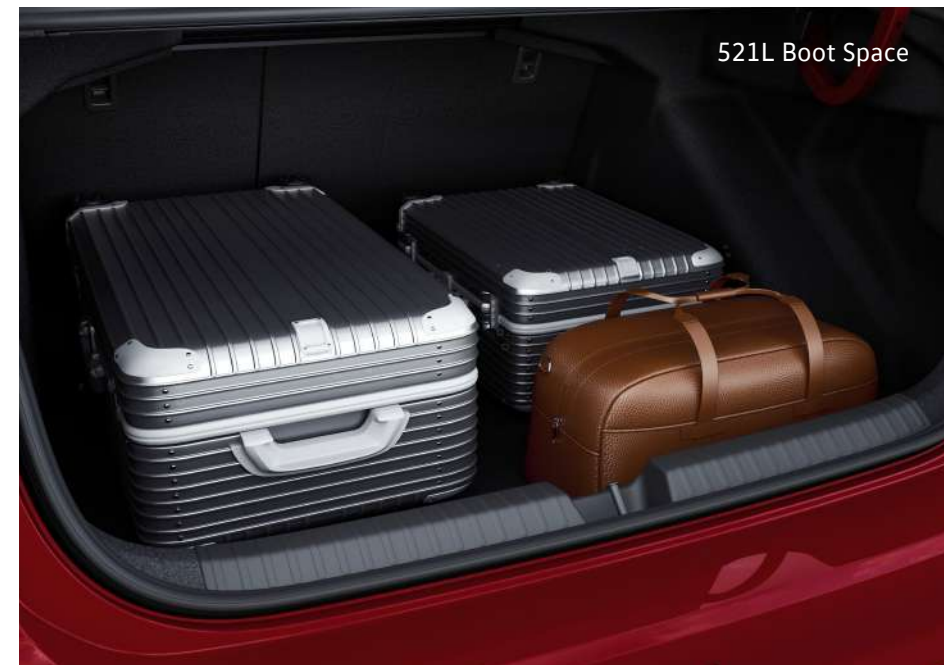
521L Boot Space

Drives are more convenient, when you're in a Virtus. Go keyless with the smart KESY feature. The multi-function steering wheel puts the Virtus at your fingertips. The Smart touch Climatronic AC and ventilated leatherette front seats keep you comfortable, no matter how long your definition of a long drive is. Virtus now also comes with first-in-segment electric seats for the driver and passenger that allows you to choose the best position and enjoy the drive with a flick of switch. A 60:40 split in the rear seats, along with a boot space of up to 521L, lets you carry your world with you, just in case you feel like turning a 20 minute drive for groceries into a 2-day road trip.