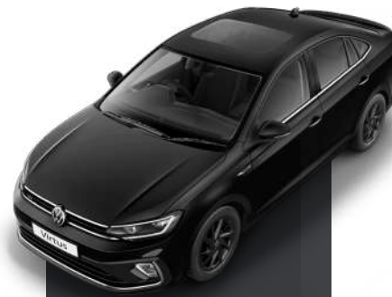
Deep Black Pearl

The clock is ticking. The units are limited. Book online now.