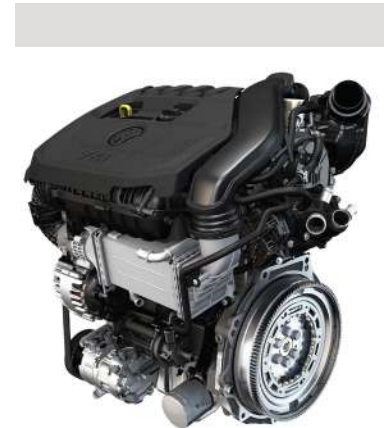
1.5L TSI EVO engine

Feel goosebumps at every turn when you're in a Virtus. The GT badged Performance Line is powered by the revolutionary 1.5 TSI EVO engine with active cylinder management technology and boasts of 7-speed DSG transmission or a 6-speed manual transmission option. It generates 150 PS of power and 250 Nm of torque. Stunning dual-tone finish and a Carbon steel grille gets hearts racing. Premium aluminium pedals, red brake callipers and black boot-lid spoiler accentuate its sportiness. While 'Razor' black alloy wheels keep all eyes on you. Finally, the iconic GT badge puts a stamp on the legendary performance Volkswagen is renowned for.